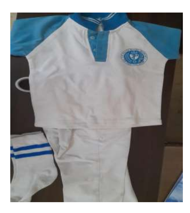
(CLASS KG-1 & KG-2)