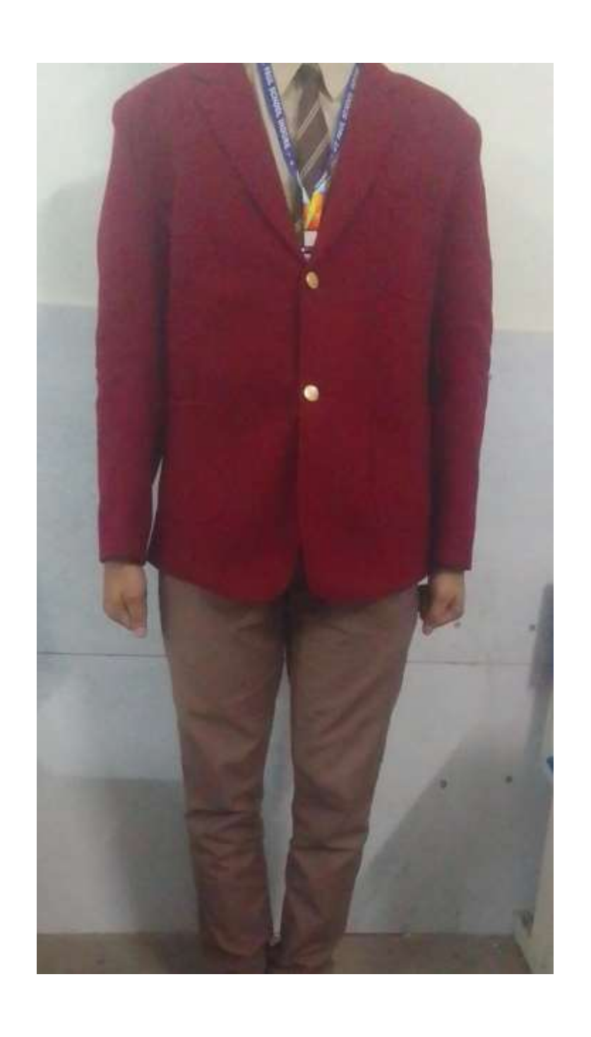
(BOYS CLASS 6<sup>th</sup> TO 12<sup>th)</sup>