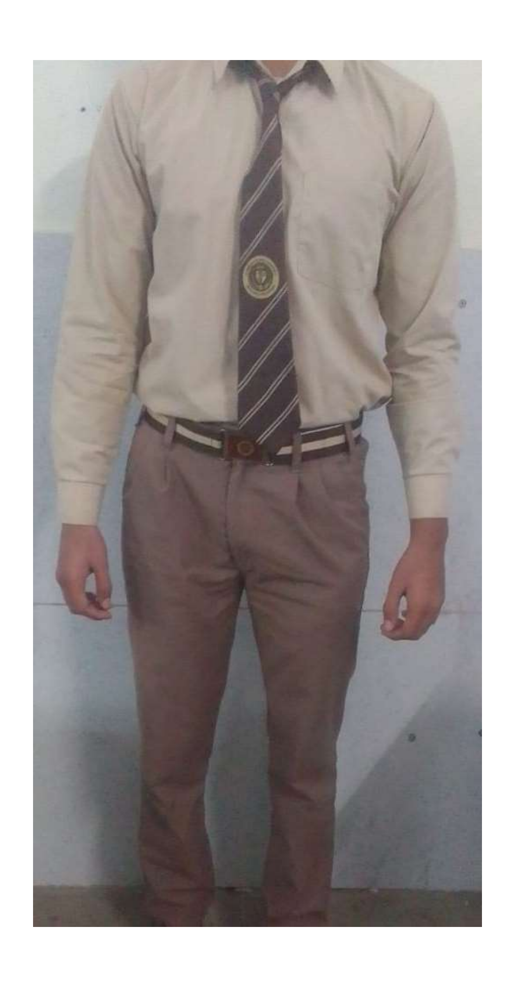
BOYS CLASS 11 & 12