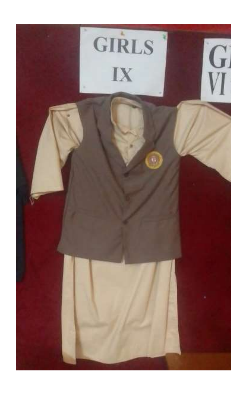
(GIRLS CLASS 9<sup>th</sup> & Above)