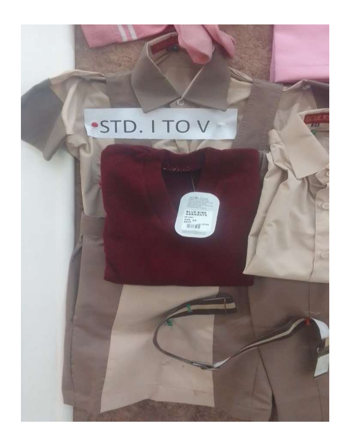
(GIRLS CLASS 1<sup>st</sup> TO 5<sup>th</sup>)