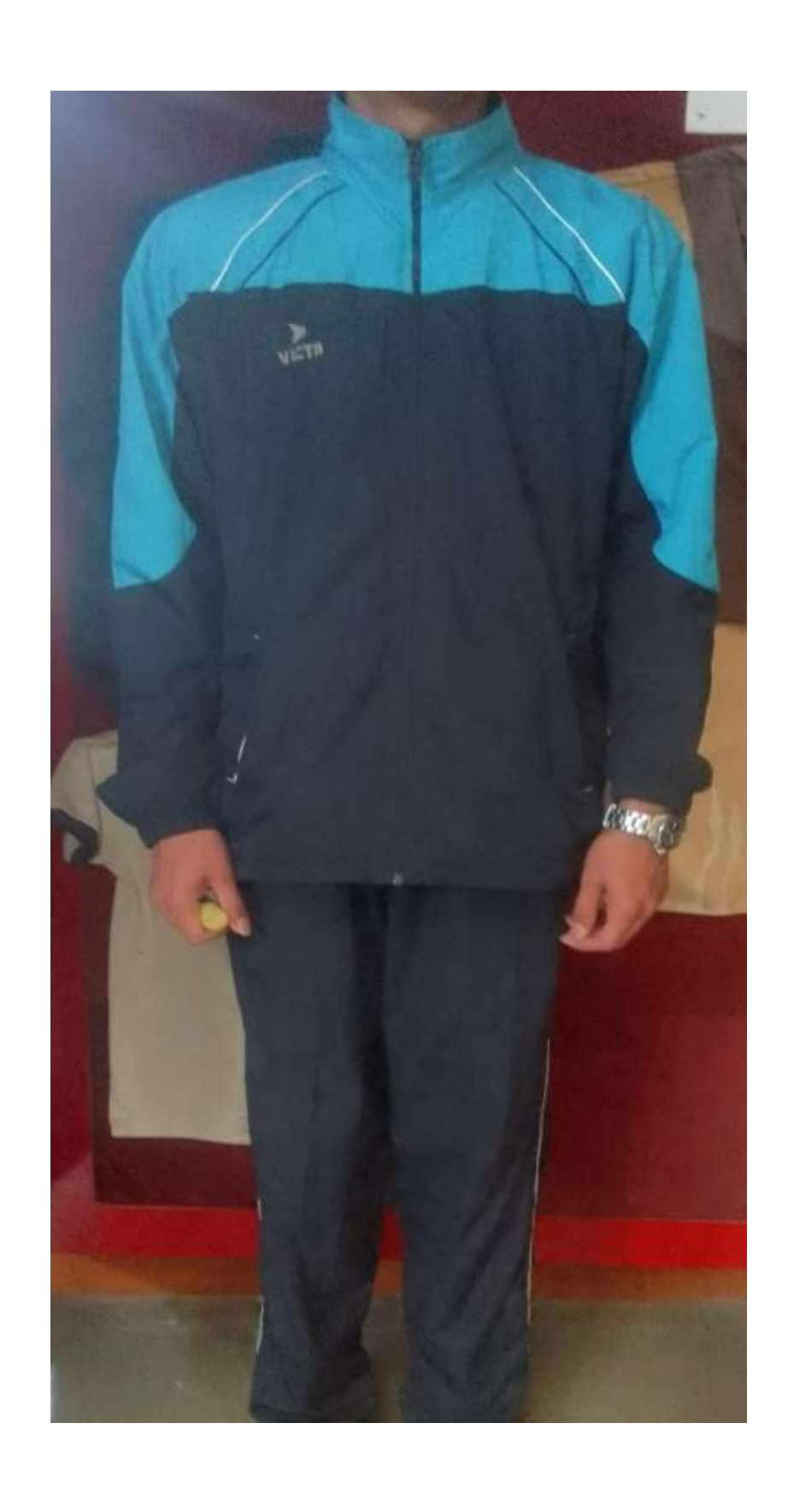
BOYS CLASS 11 & 12 (Physical Education Dress )